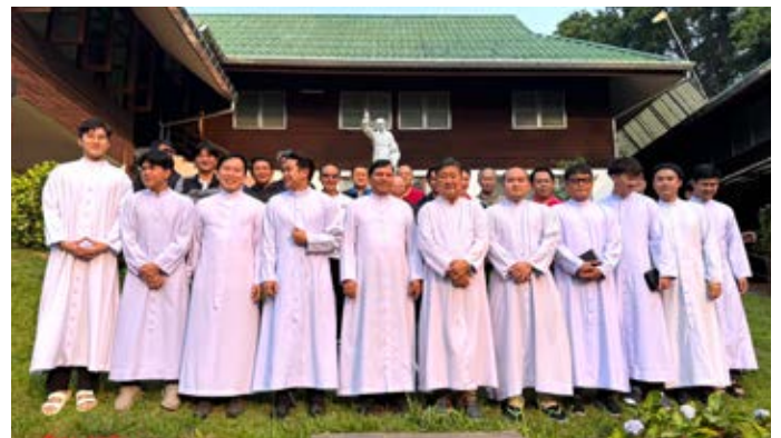
The Brothers joined the annual retreat.