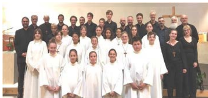
The choir in liturgical dress.

Today, following a move, they are students at the Sainte Cécile La Salle Secondary School located not far from the community of the Brothers of Saint Gabriel on Rue des Fours