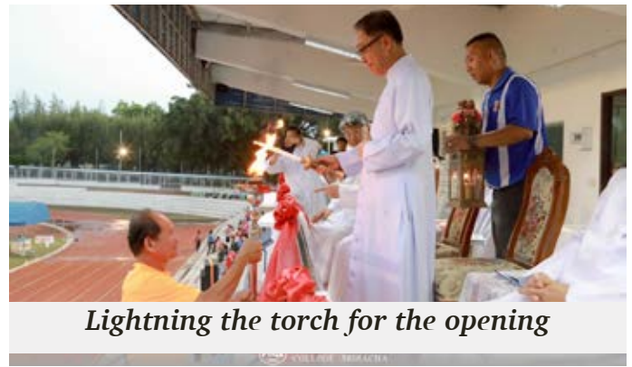
Lightning the torch for the opening