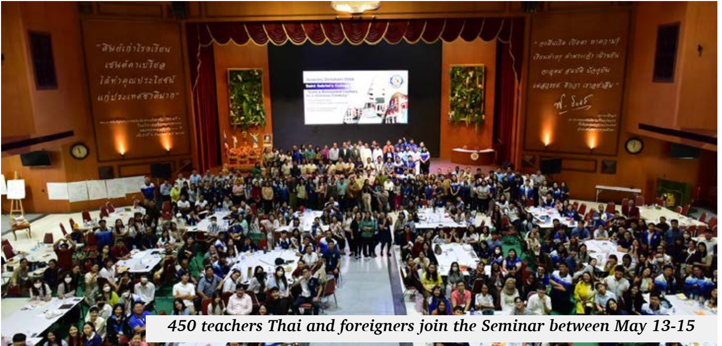
450 teachers Thai and foreigners join the Seminar between May 13-15