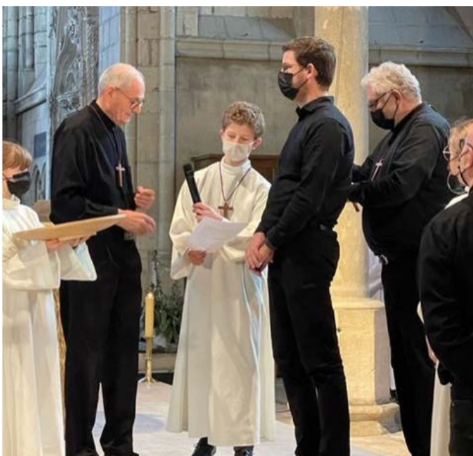
Presentation of the Cross of the Young Singers

Three years ago, I passed on my mission to a committed lay adult, but I continue to sing in this choir, which is now part of who I am.