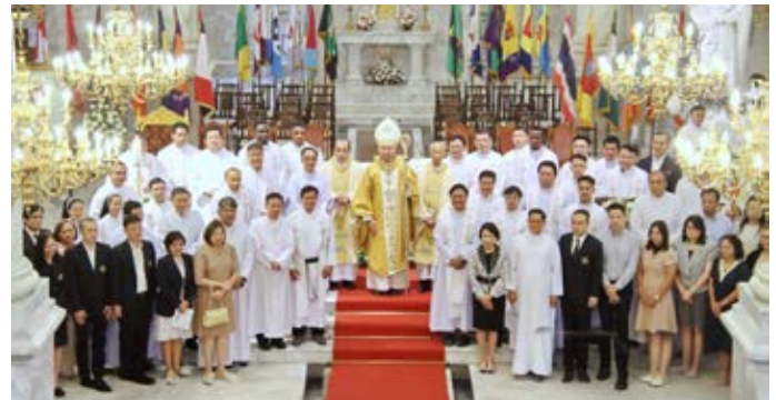
Priest, Brothers, Sisters, Au Administrators joined the function to celebrate Montfort Chapel.