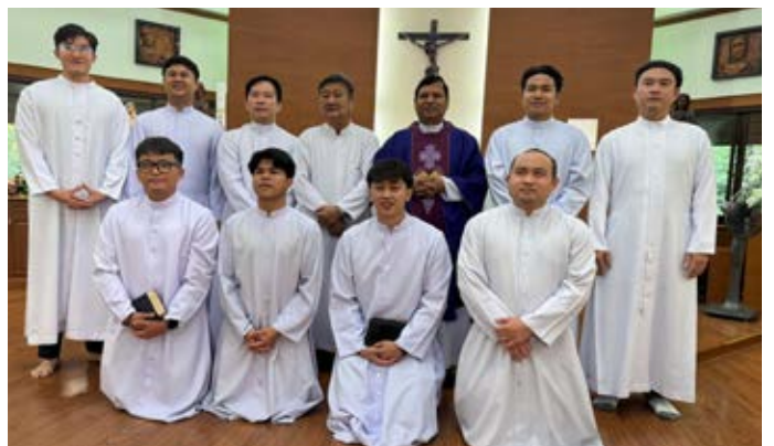
The Brothers renewed the vows this year.