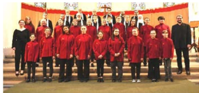
The choir in concert dress.

We got to know and appreciate each other, and I was surprised when he came to the community to ask me to become chaplain to the children's choir he had created at La Salle Cathedral College. After much thought and hesitation, I accepted and began my mission in September 1994.