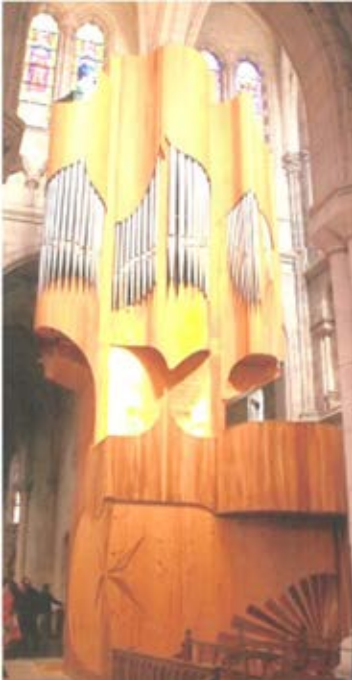
The Great Organ of Notre-Dame Church in Challans